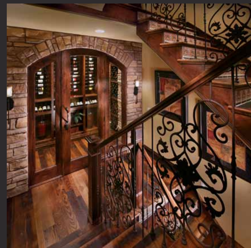
Inspired Italian Country