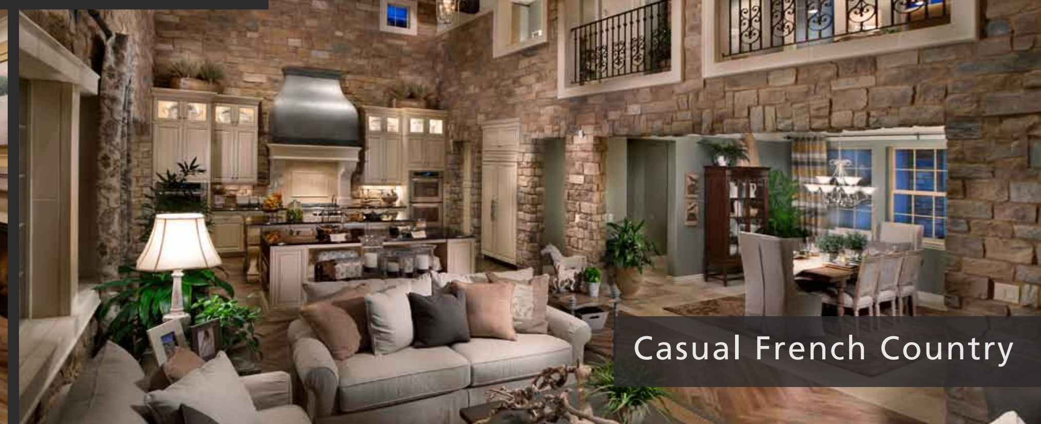
Casual French Country