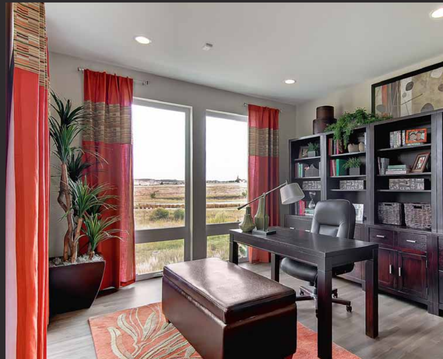
Joyce Homes - St. Jude Dream Home